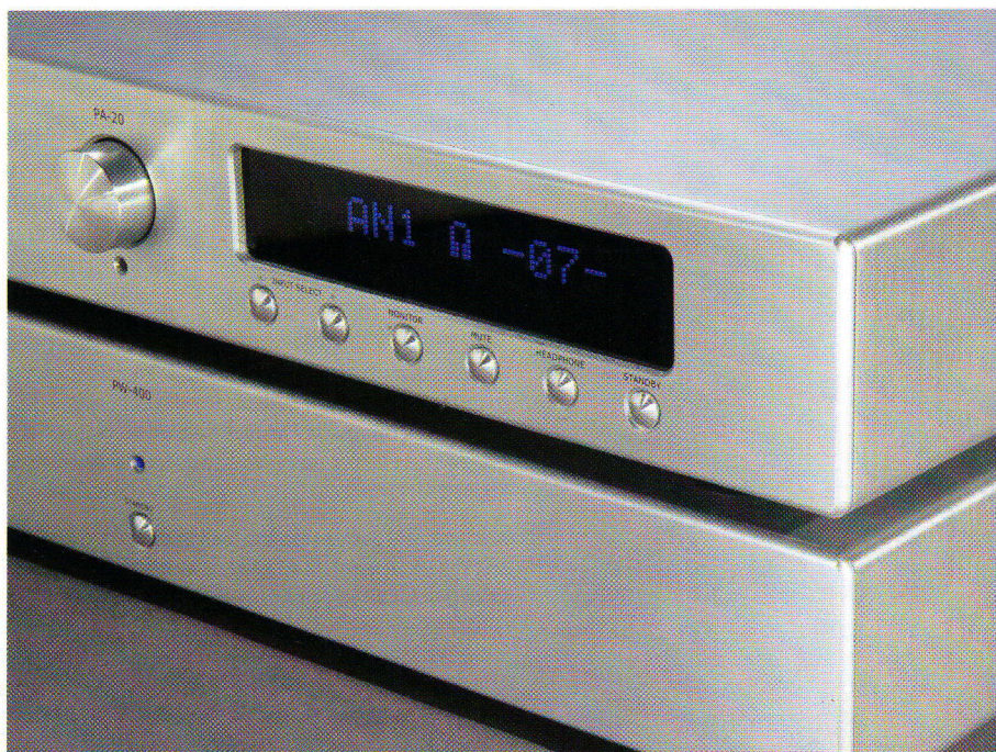
RIGHT: The PA-20 preamp's volume control offers independent line/headphone output and adjusts in larger or finer steps according to how fast you spin the dial. Volume, input selection, tape monitor and mute are also on the remote

Fitted with superlative multi-way binding posts and both phono and XLR inputs at the back, and rated by Micromega at 400W/ch into 4ohm