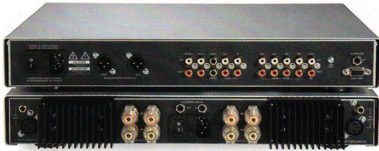
ABOVE: The PA-20 preamp offers five line, one MM phono and one tape input with 'Pro' (processor bypass) and sub loop-through connections. Balanced outputs link to balanced inputs on the PW-400 which offers two sets of stereo speaker binding posts

rendered utterly incendiary by a French replay system. By the time you get to 'Cry Me A River', you'll need a cold shower. Even the schmaltzy 'The Trolley Song' can cool the ardour.